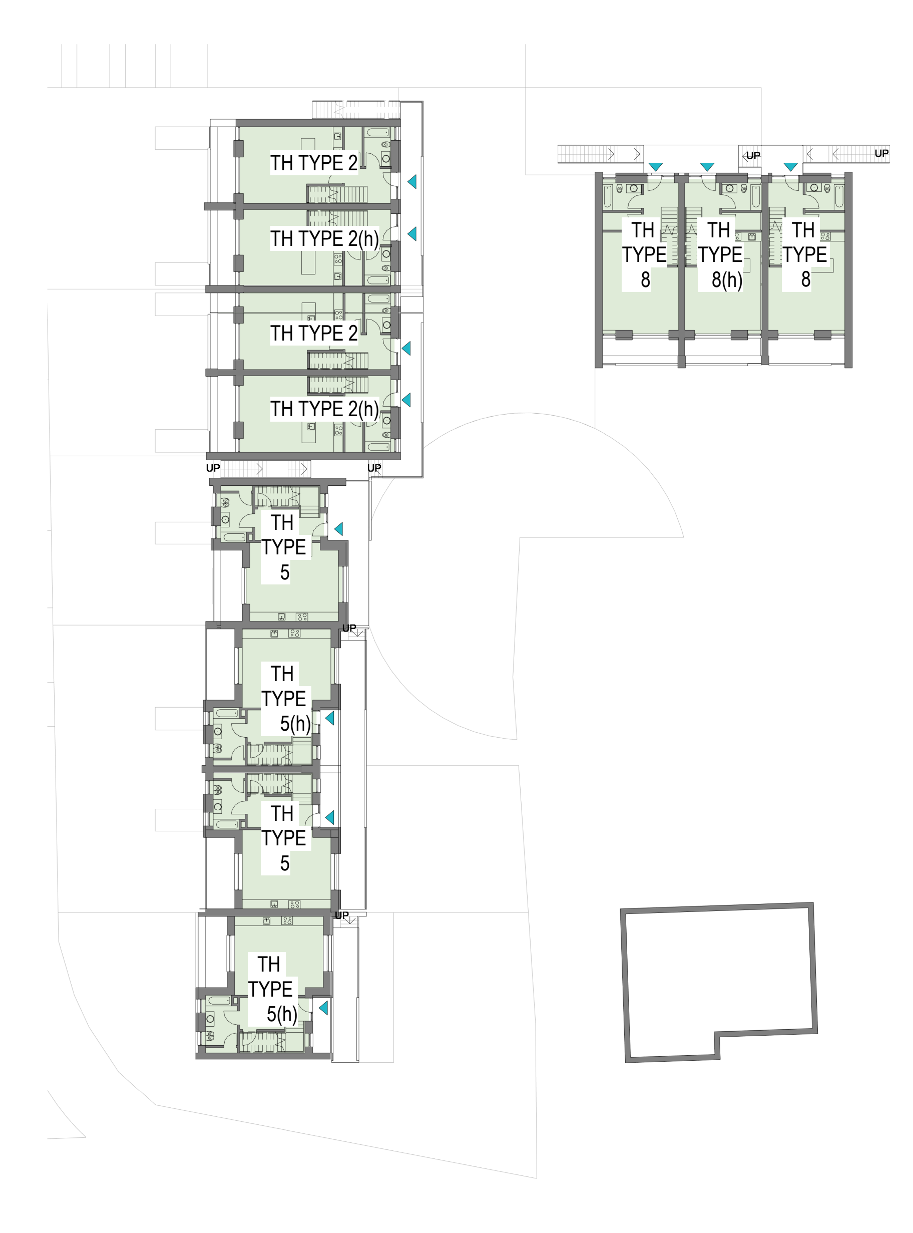
GA - LEVEL 01 - TH - UNIT TYPE LOCATIONS 1 : 250