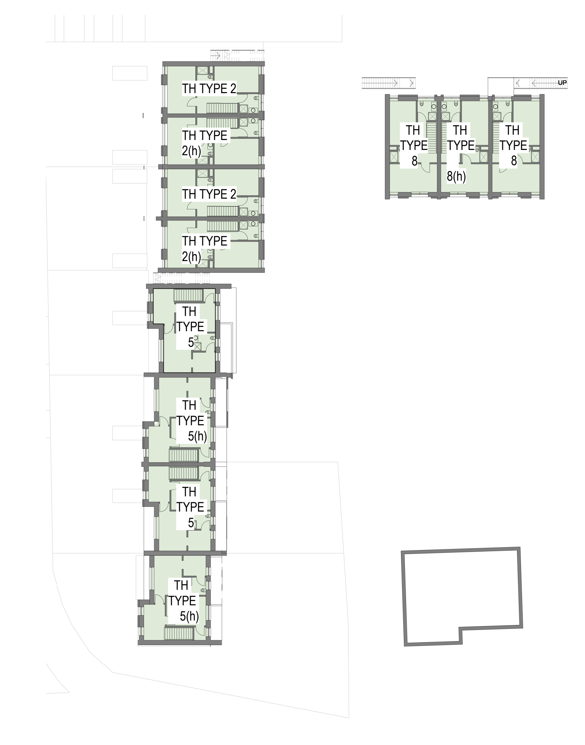
GA - LEVEL 02 - TH - UNIT TYPE LOCATIONS 1: 250

ALL DIMENSIONS TO BE CHECKED ON SITE NO DIMENSIONS TO BE SCALED FROM THIS DRAWING DRAWING IS TO BE READ IN CONJUNCTION WITH RELEVANT CONSULTANTS DRAWINGS